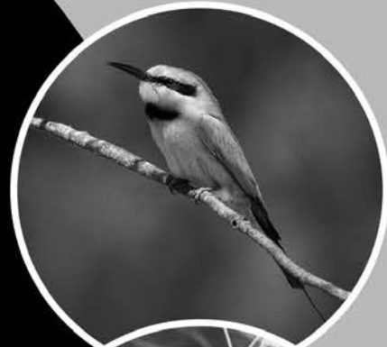
Photo credits: Rainbow Bee-eater, Francesco Veronesi; Aboriginal weaving demonstration, Tourism NT; Tropical paradise in East Arnhem Land, Tourism NT/Aaron Avila.

SER2023 will focus on the connection between culture and nature , including the role of restoration in enhancing and rebuilding that connection, while also elevating the value of traditional and local ecological knowledge and practice.