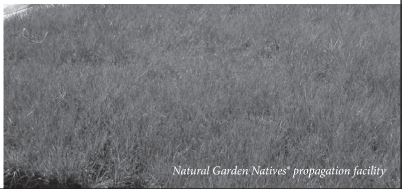
Natural Garden Natives® propagation facility

60 YEARS OF PROPAGATING AND GROWING EXPERTISE