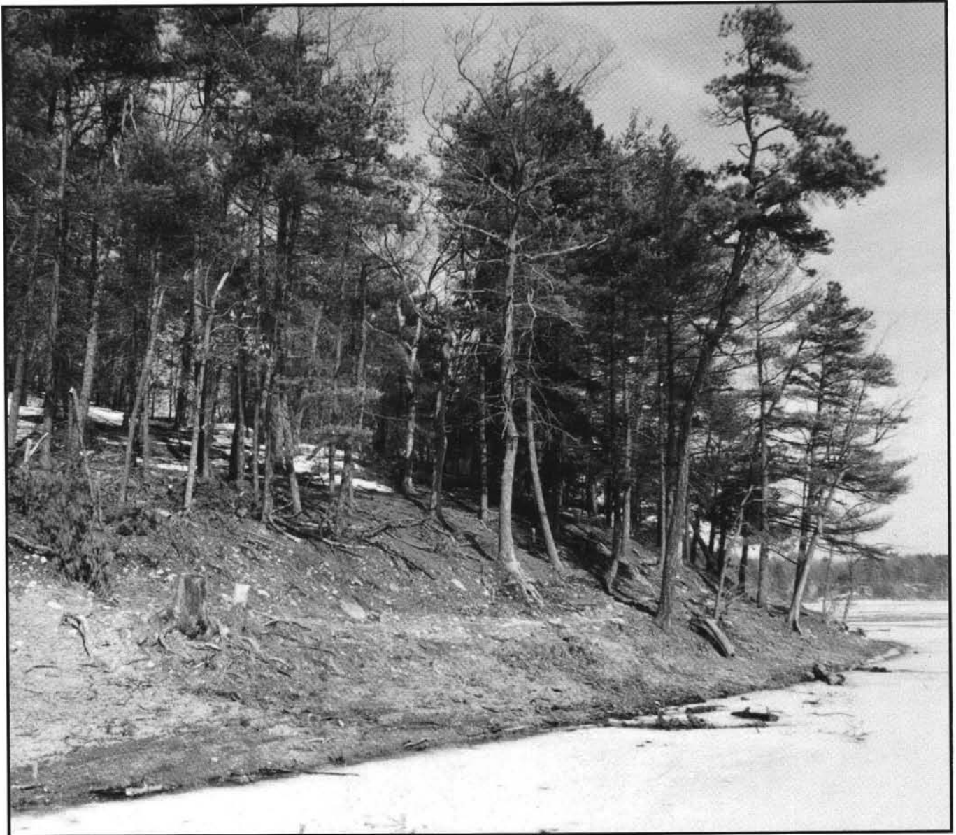
Restoration at Walden Pond