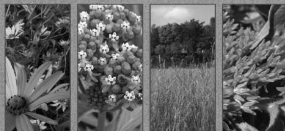
NATIVE PRAIRIE GRASS AND WILDFLOWER SEEDS

Native seed mixes for CRP, CREP, DOT, BWSR, reclamation, residential, commercial, and public projects.